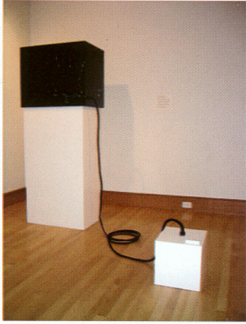
Above: Dislocation of Intimacy , 2004, Installation View, Cambridge Art Center